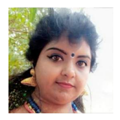
Principal VKSD GURUKUL