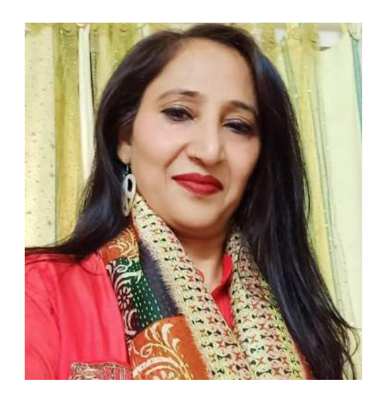
COUNCIL MEMBER SCHOOL LECTURER DELHI GOVT, LIFE COACH