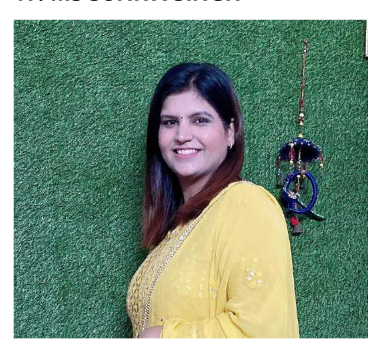
COUNCIL MEMBER - WORKS FOR WOMEN EMPOWERMENT