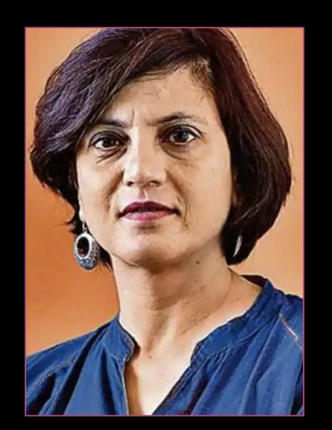
National Vice President Culture and Heritage Council