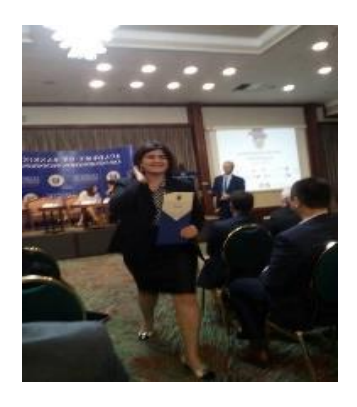
Mani Consalting owner