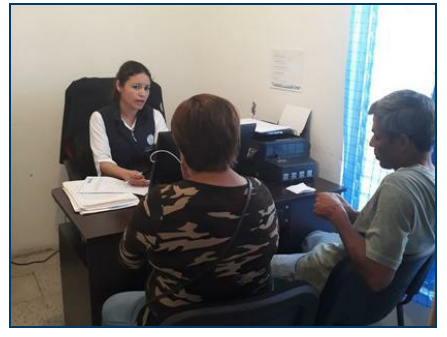
Legal and psychological counseling